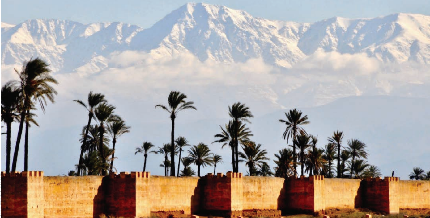
In an extraordinary contrast in imagery, palm trees wave in the warm breezes just beyond the walled Kasbah on the approach to Africa's remote snow-capped Atlas Mountains, with the majestic 13,671-foot Mount Toubkal, Morocco, standing guard.

savoring some of their last runs together in the sun.