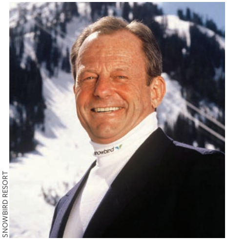
Through grit and dogged determination, Snowbird Resort founder—and amateur mountaineer—Dick Bass improbably became the first person to summit the highest peak on all seven continents.

There were, naturally, other Antarctic ski descents under far less enticing conditions. At Waterboat Point in Paradise Harbor, in the kind of deteriorating overcast that Antarctica is really famous for, we aborted a mainland climb after unanimously