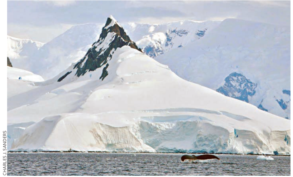
The fluke of a Humpback whale confirms why sailors named this magnificent spot in Antarctica "Paradise Harbor" early in the 20th Century.

Upon their arrival at Base Camp, a disappointed Kit announced that in her opinion she had not truly completed an uninterrupted ski descent. With few exceptions, the world demurred, adopting the widely accepted view of Dick Bass that judging fulfillment of spectacular but amorphous endeavors such as these is simply not an exact science. Having climbed up and descended on skis from the summit of Everest, downclimbed a belay section in order to save a life, and continued down from Camp IV through the most difficult, skiable portions of the route, Kit DesLauriers has generally been recognized as the first person-man or woman-ever to climb and descend