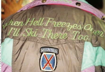
Left: The famed gondola of La Grave, France—perhaps the most extreme ski resort on the globe—offers a bird's-eye view of Le Meije, in the French Alps. Above: If anyone ever has a doubt about the spirit and toughness of the U.S. 10th Mountain Division's members, they'll let you know otherwise.

ful—even mystical—winter mountain landscapes, are all life-affirming gifts impossible to describe to those who have not experienced them.