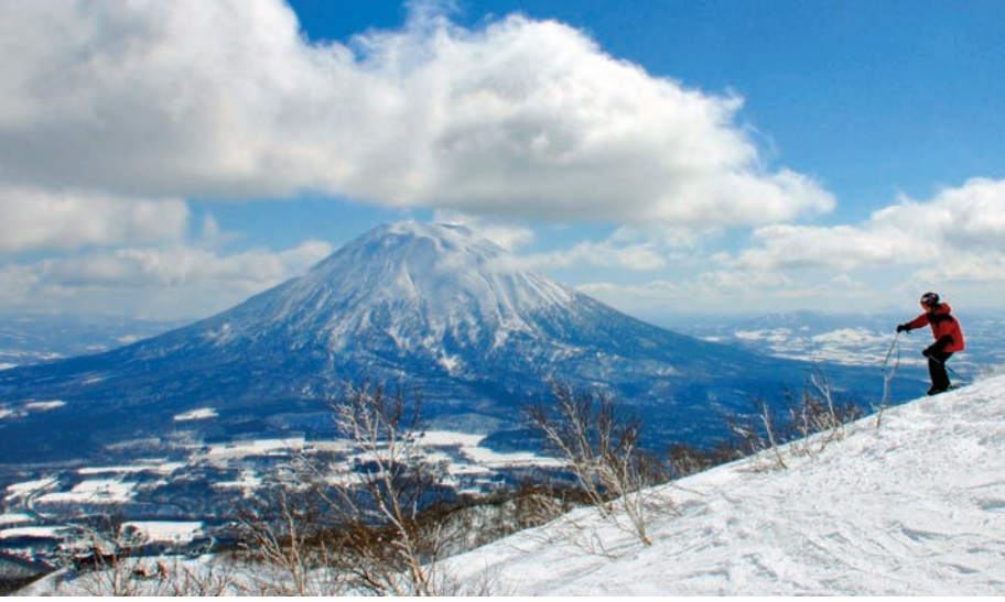
A stratovolcano located in Shikotsu-Toya National Park, Hokkaido, Japan, Mount Yotei is famous for being located in the powder-blessed region that is home to several of Japan's most popular ski resorts. Skier: Jackson Sanders.

above, and splashing into the icy water. In full arctic winter gear, and carrying the usual inventory of avalanche probes, shovels, beacons, ropes, radios, crampons, skins and skis, we descended with our guide Andrew Eisenstark for the trip to the landing zone. The islands and mainland of Antarctica are accessible by water only at the rare points where glaciers and land slope gently into the sea. Most of the steeply cliffed shoreline sits five to ten stories above the water.